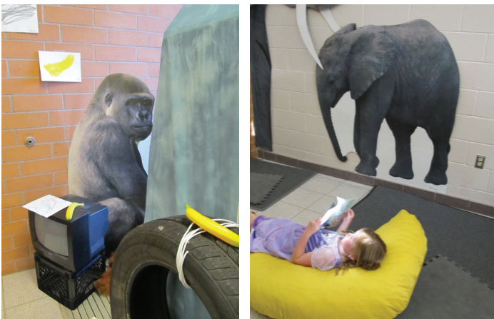
South Range Elementary enjoying this years One School, One Book club pick - The One and Only Ivan by Katherine Applegate.