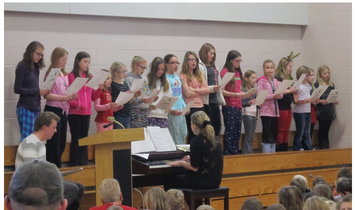
South Range Elementary 2014 Christmas Program.