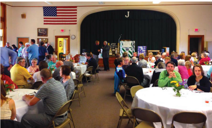
2nd Annual Fundraiser Dinner in the 'Old Assembly Room'